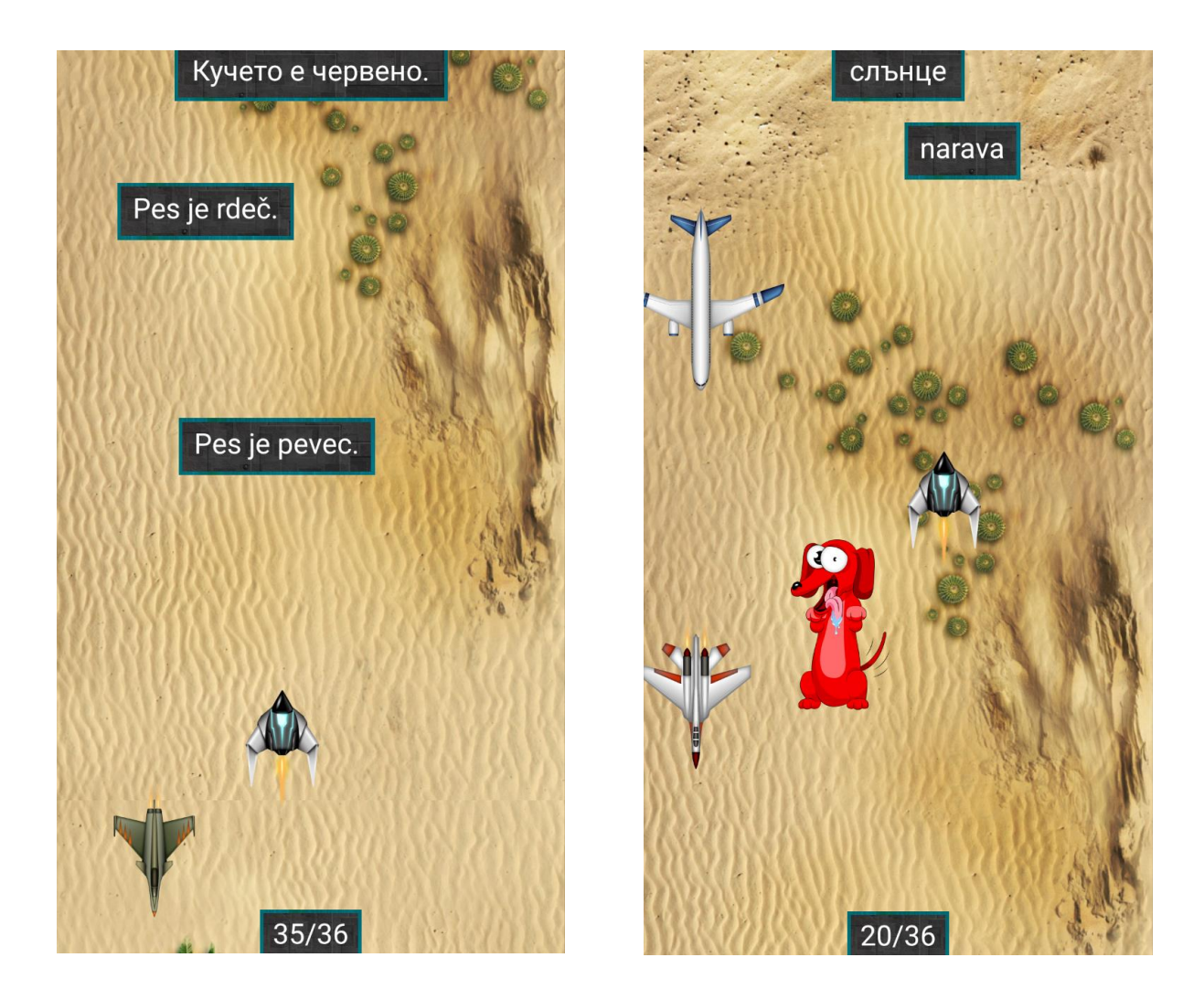
Certain words and expressions are transformed into pictures corresponding to their meaning after being hit.

After successfully playing the Challenge mode in both directions of translation, the participant sees on the screen a compiled text in the foreign language containing the lexemes already learned during the game. He reads it and it is expected to understand its meaning.