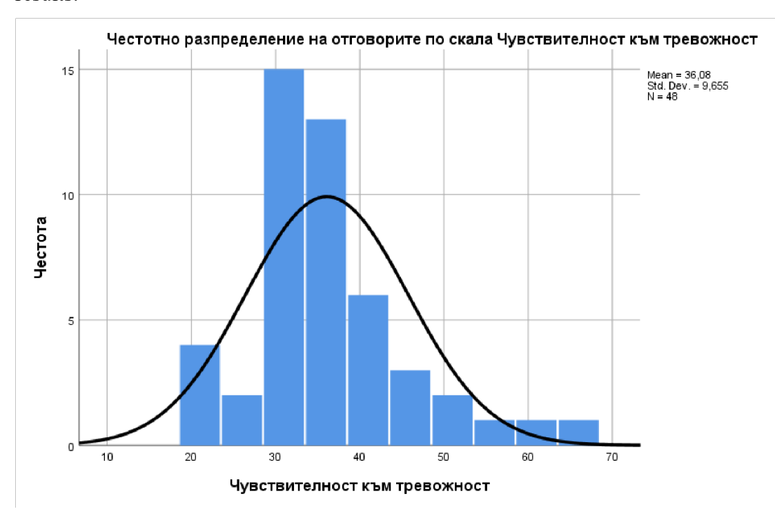
Figure 1. Frequency distribution of responses of patients undergoing cardiac intervention on Anxiety sensitivity scale.

It is possible that Anxiety sensitivity is one of the dimensions by which patients have certain specifics.