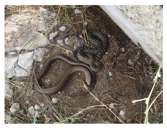
Figure 2. P. apodus and E. sauromates found coiled together under a flat rock.

Some potential reptilian competitors for food sources were also found. Other lizards, like the lacertids Lacerta viridis and Lacerta trilineata , are species that commonly prey on large, mostly coleopteran insects (Peters, 1963; Angelov et al., 1966, 1972; Donev, 1984; Donev et al., 2005; Mollov et al., 2012; Mollov and Petrova, 2013).