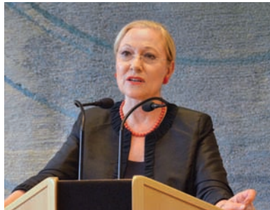
Opening Ceremony 2012