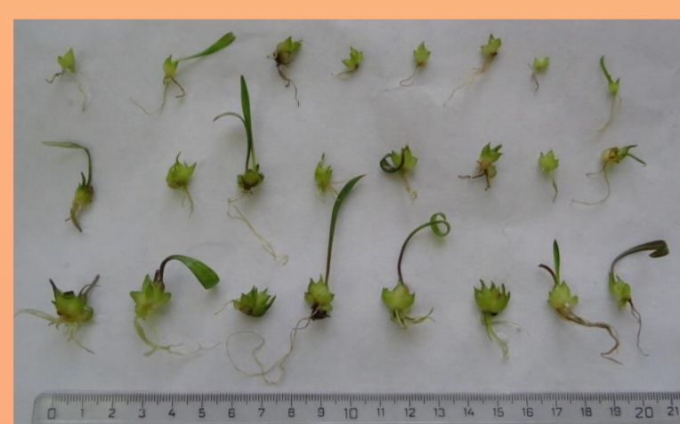
Fig. 2. In vitro bulblets of L. rhodopaeum used as starting material for hydroponic experiment.

Material and methods: Plant bulbs were taken from the largest population of the species in Bulgaria, in the protected area "Livadite" near Sivino village (Fig. 1). Bulb half-scales, used as initial material for in vitro clonal propagation, were disinfected by soaking in 70% ethanol for 1 min. and 50% commercial bleach for 60 min., then rinsed with sterile distilled water three times for 10 min. Explants were put on MS based media supplemented with different plant growth regulators, to form bulblets. Growth of 75 uniform in vitro bulblets evenly distributed in 3 variants (Fig. 2) has been tested: on Flood & Drain hydroponic system (with perlite as substrate), Cutting Board hydroponic system (deep water culture system, peat cubes as substrate), and Control (soil substrate, wick system).