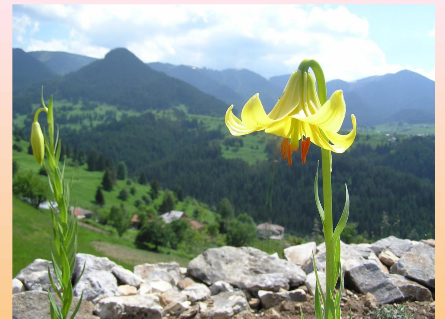
Fig. 1. Lilium rhodopaeum in the natural population near Sivino village.