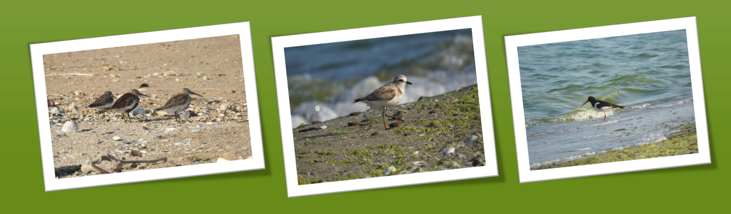
Picture 4 . Dunlins ( Calidris alpina ), common ringed plover (Charadrius hiaticula) and Eurasian oystercatcher ( Haematopus ostralegus ) feeding and resting along the shore.

Most typical species during all seasons included the yellow-legged gull (Larus michahelis) and the black-headed gull (Chroicocephalus ridibundus), which were often observed to be following fisher vessels and using them for easier feeding. Great cormorants (Phalacrocorax carbo) also explicit this strategy, but they are counting on what the gulls miss. From the waders most abundant was the little ringed plover (Charadrius dubius). During migration the species composition changes, with more waders using the littoral area. One of the most abundand species in this period is the white wagtail (Motacilla alba).