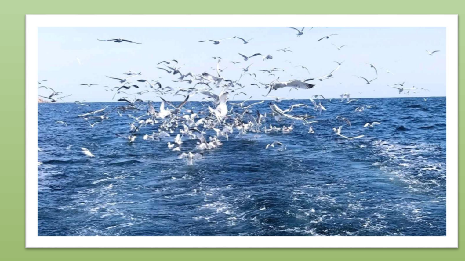
Picture 3 . Gulls following fisher vessel and feeding with the leftover fish.