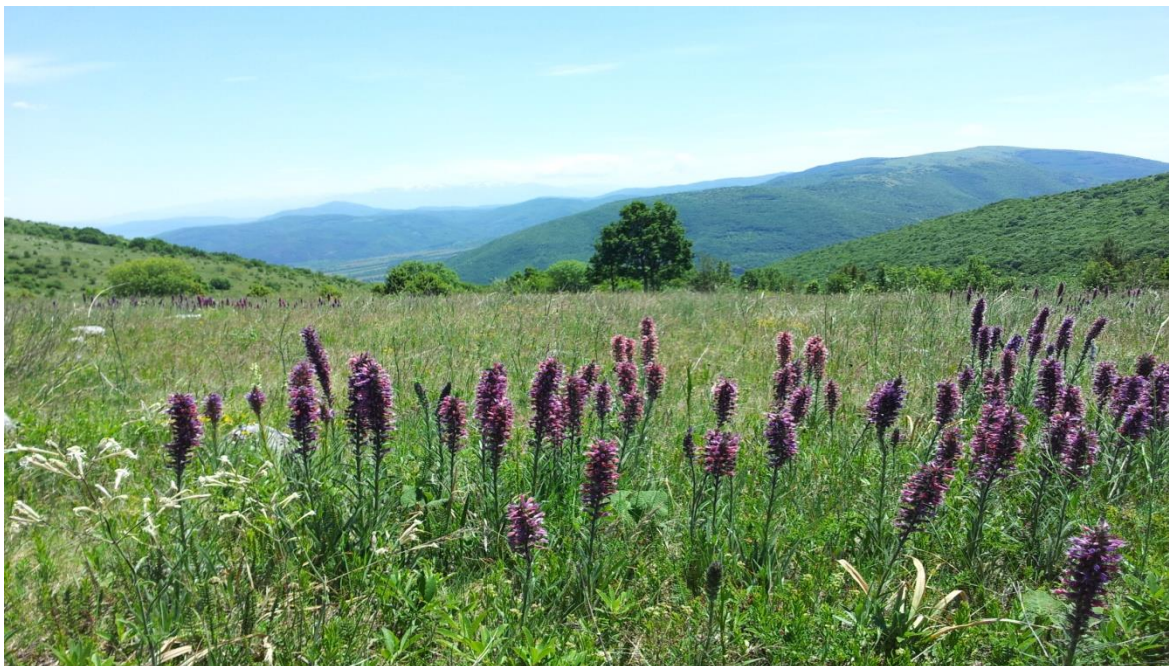
Fragment of Pontechium maculatum population

The future prospects for its existence are positive, as at this stage there are no immediate threats.