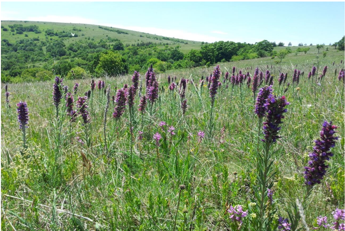
Fragment of Pontechium maculatum population