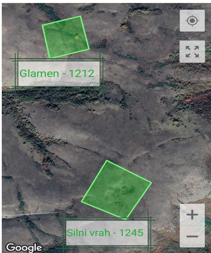
Population of Pontechium maculatum on Mt Zemenska