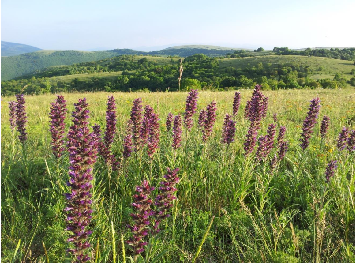
Fragment of Pontechium maculatum population