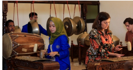
Darmasiswa and local students are playing Gamelan instruments