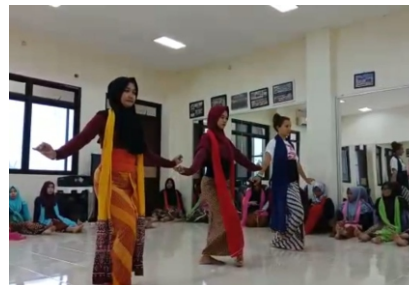
Darmasiswa student of UMP is dancing Tari Capat-Cipit from Banyumas regency