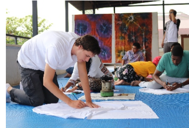
Students of Darmasiswa UMP are drawing Batik.