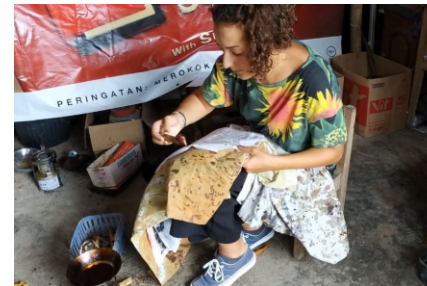
Darmasiswa student of UMP is putting wax on the Batik pattern