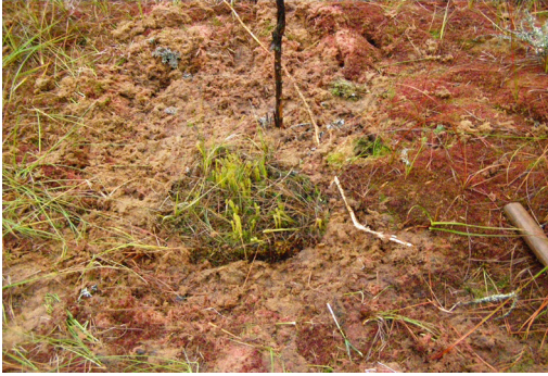
A. in 2007