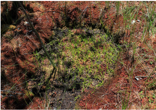
B. in 2015