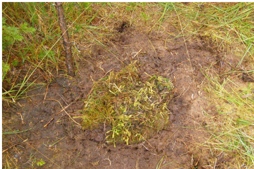
A. in 2007

The experiment was performed on the Sphagnum islands in two of the Chairski lakes (Central Rhodopi Mts.) – Golemia gyol and Kadirev gyol. It lasted for 8 years. Plant material was taken from the nearest population of the species at lake Lagera (Smolyan lakes). Since the ecology and biology of L. inundata in Bulgaria is still poorly understood, we made two transplant plots of ca. 1 m 2 . The plots were cleared off vascular plants and 2-3 cm of the peat moss cover was removed (Figs. 1A, 2A). Thus, we created a microhabitat that was similar to the source population. The plot at lake Golemia gyol was made within Sphagnum fallax / S. flexuosum stand (faster growing at a wetter site). The plot at lake Kadirev gyol was made in a pure S. capillifolium mat (slower growing at a relatively drier site). In the middle of each plot, we inserted one ca. 25×25 cm clone of L. inundata . The plots were visited in 2008, 2010, 2013-2015. During each visit the size of the clone was measured and the number of fertile shoots was counted. We cleaned also the vascular plants that were growing within the plot area and the clone itself as much as possible, taking care not to disturb L. inundata .