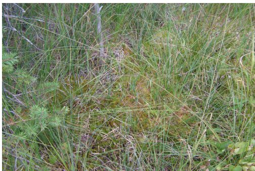
B. in 2015