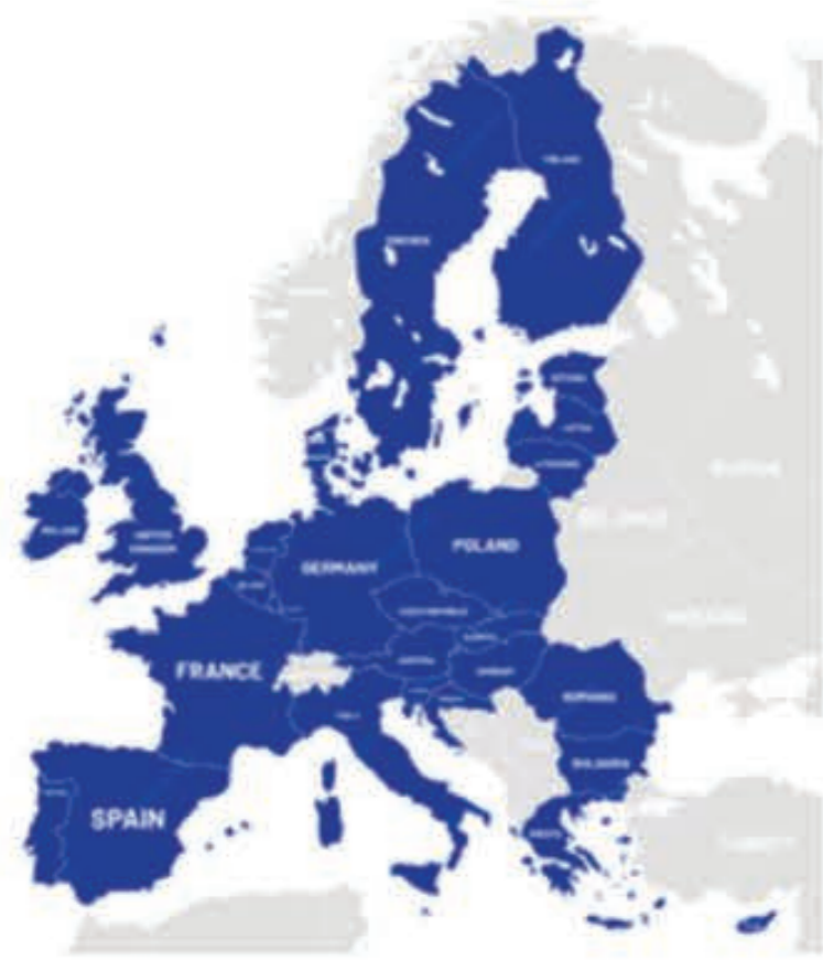
Comparative dataset covering all 27 EU member states

This study examines how different regulatory models across the EU shape electoral competition, party system structure, and the effectiveness of campaign spending in the digital era.