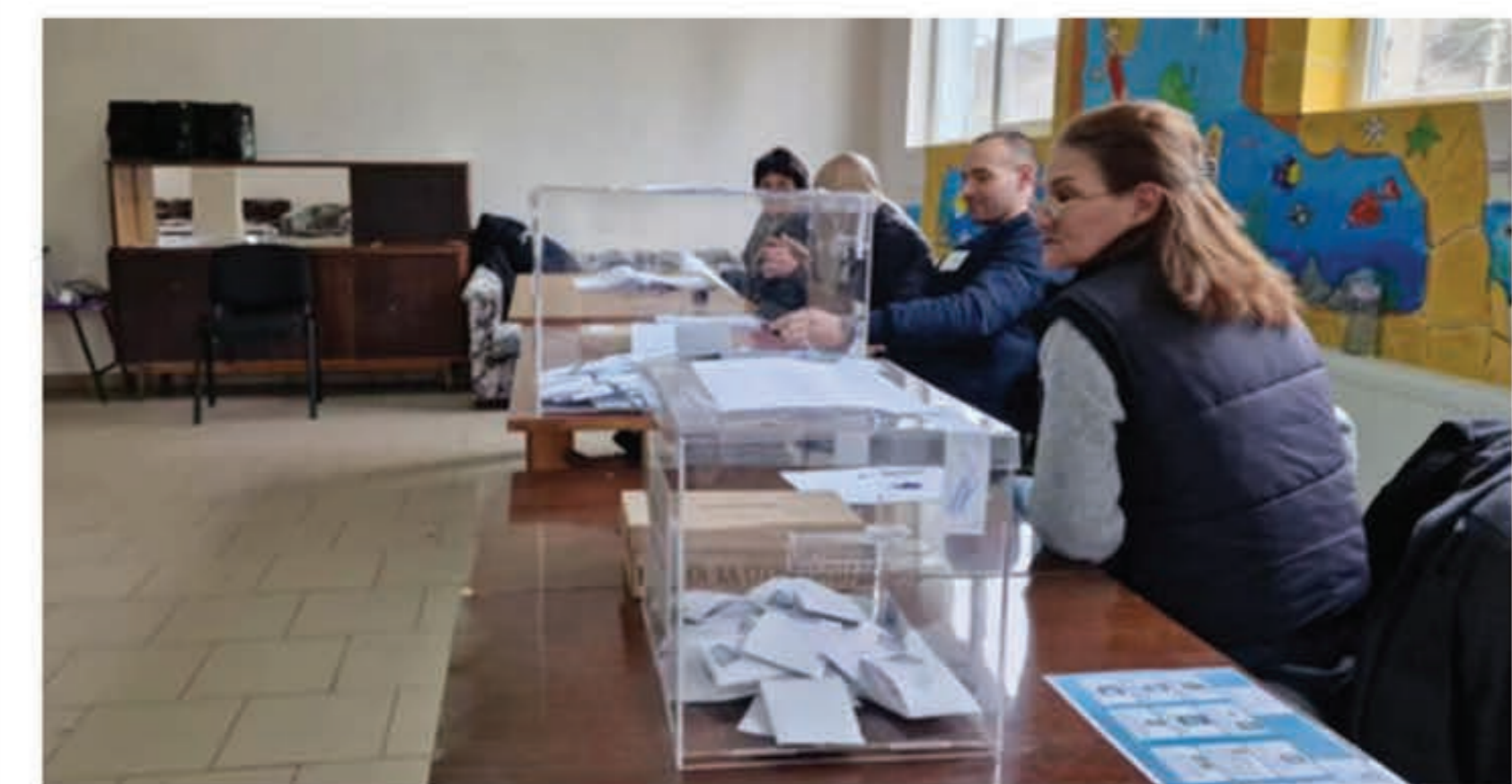
Process in polling stations (case context)

Process development · Preferential voting · Machine voting · Invalid ballots · Polling administration · Surveillance · Reform proposals