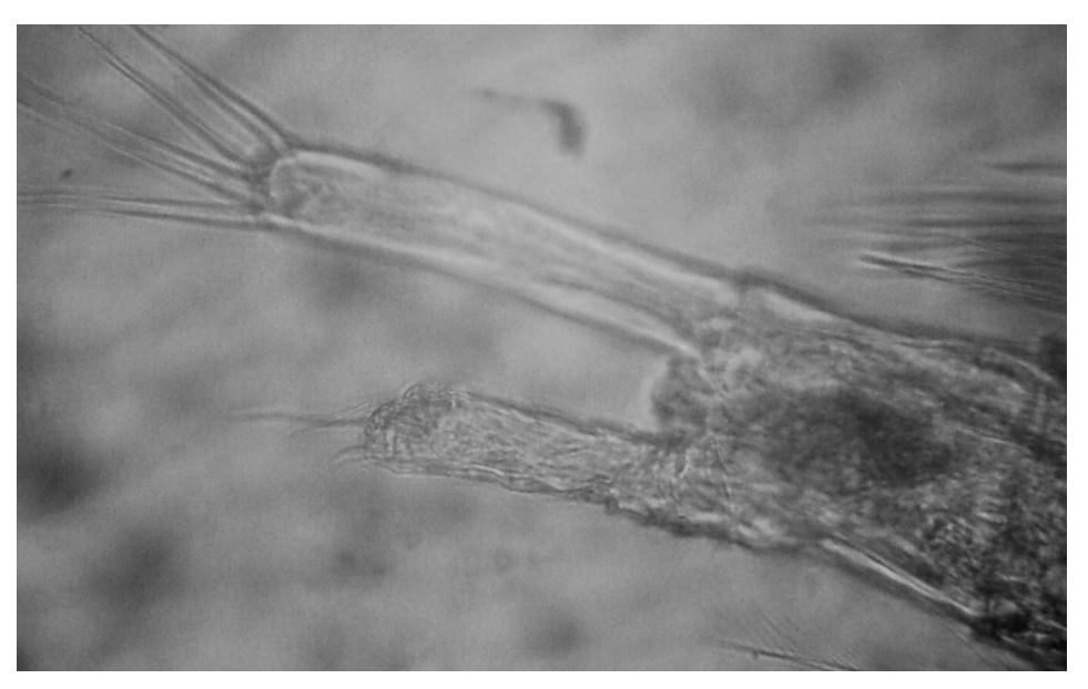
Fig. 3. Teratological changes in the one branch of the furca of C. vicinus .